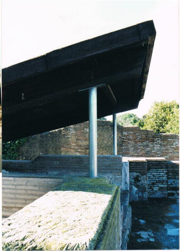
Ostia: Terme del Filosofo